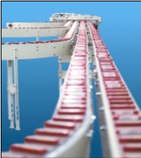
Merger Infeed Lanes